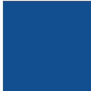
Dark Blue 21-T009-03